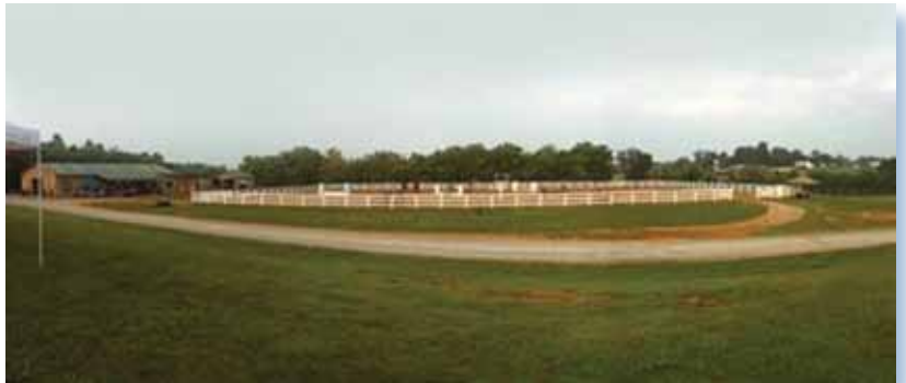
The main barn and arena at Select Sport Horses.