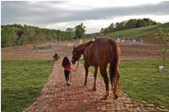
View of the upper arena from the barn at Hidden Hollow Farm.