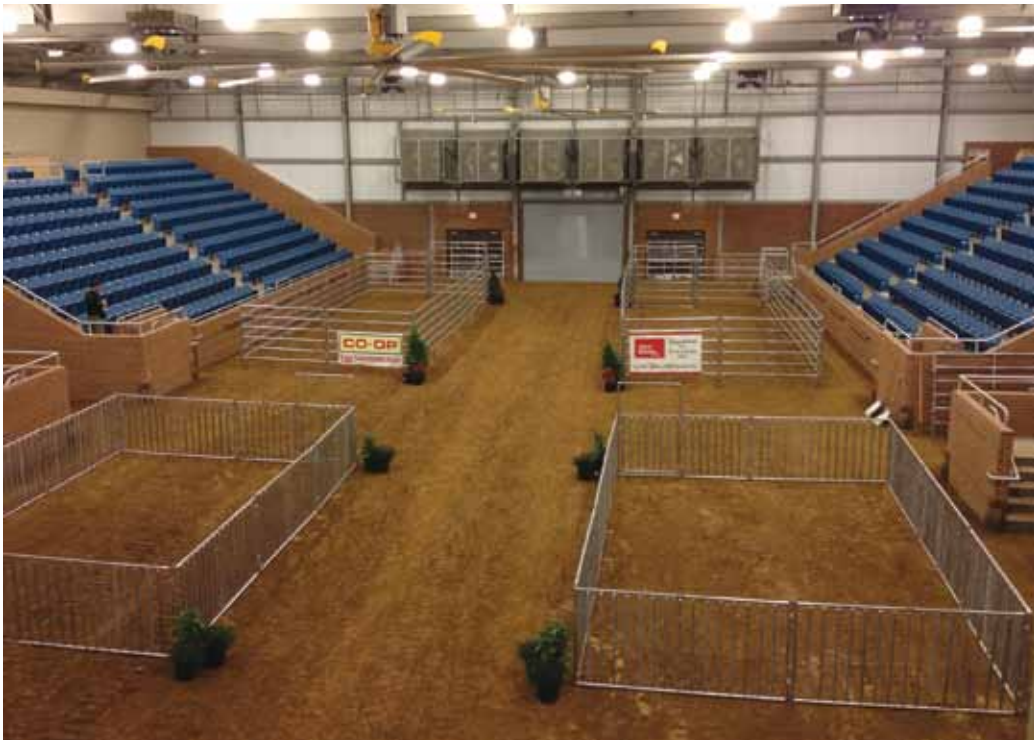
The new Brehm Animal Science Building includes a state-of-the-art arena.